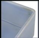
Distressed Coastal Blue