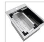
15" RV SINK