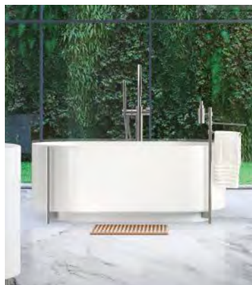
Hastings Bath Collection's Poli tub showcases an oblong shape and features optional legs and an array of accessories to enhance the bathing experience, notes the company. The tub is available in 12 contemporary colors. hastingsbathcollection.com