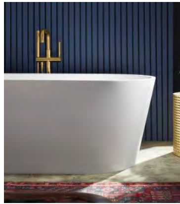
The Evok Oval freestanding bath features a 17" depth that allows for a deep, immersive soak. With seamless acrylic construction, the Kohler tub includes integral lumbar support, built-in integral overflow, toe-tap drain and location versatility. kohler.com