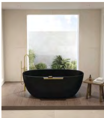
Fleurco's Lucia solid surface bathtub, part of its Aria Stone Collection, is designed with a vast interior for a luxury soak, states the firm. The tub is available in a range of color and finish options for personalization. fleurco.com