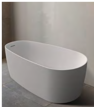
The newest tub from Barclay Products , the Olivia 59" freestanding bathtub features a modern oval design. Made from lightweight acrylic, the soaking tub is available in a matte white finish and is compatible with the air jet system. Six drain finishes are offered. barclayproducts.com