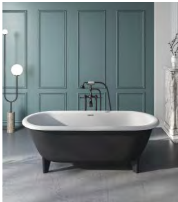
Tubs from StoneTouch are fashioned in Italy and blend the look of classic with modern, with a claw-foot inspired design. The Elton tub, shown, is derived from the Dolomite Mountains in Italy and crafted for maximum comfort and functionality, states the firm. stonetouchbath.com