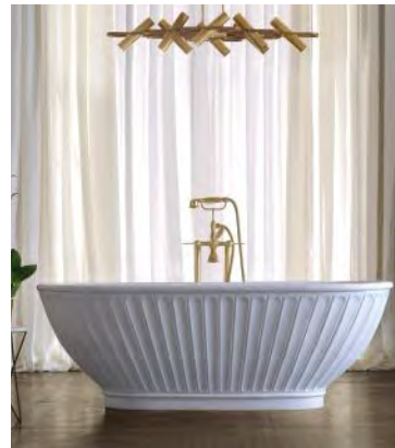
Sbordoni's Livia tub features softly shaped edges and bases, with its neoclassic style recalling the Roman thermal spaces, notes the firm. The solid surface tub showcases a delicate and elegant pattern of grooves that create a balance of light and shade, the company adds. sbordoniceramica.com