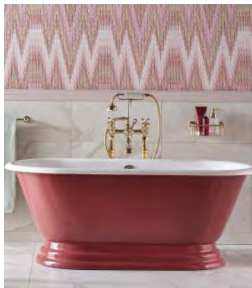
Designed for smaller bathrooms, Drummonds' Regent tub is a more compact version of the Meon, and offers above-the-floor plumbing while retaining the style of a traditional cast iron bath. With a double-ended design, the tub is cast from iron and then finished in painted enamel. drummonds-uk.com