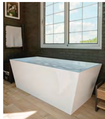
The Element Glacier Chill Plunge tub allows the user to immerse in icy-cold water set at 3°F (37°F). Valley Bath & Kitchen's Plunge tub seamlessly transitions to a hot water bath, reaching up to 104°F. The tub can be installed both indoors and outdoors. valleyacrylic.com

Rounded shapes are popular, and size preferences vary, with many manufacturers seeing tubs from 58" to 66" in highest demand.