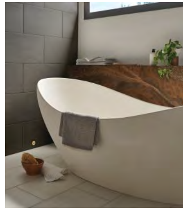
Airmada's AirJet Shower Drying System delivers a maintenance-free shower experience. Available in eight finishes, the system uses a series of air-jet nozzles, set flush to the ceiling or walls of the shower, to rid the area of dampness. It reduces drying time as well as mold and mildew. airmadadry.com