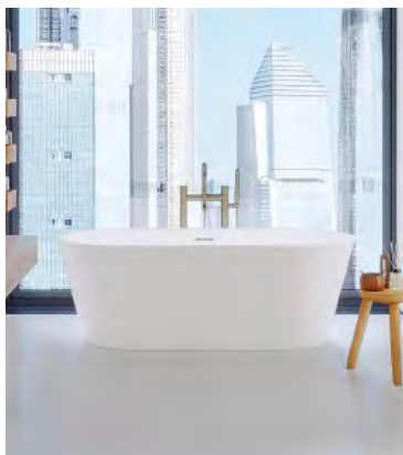
The Evalina oval tub from MTI Baths combines clean lines with a flat rim. Part of the Boutique Collection , the handcrafted Evalina is offered as a soaker or air bath and made of the company's SculptureStone material. It is available in white or biscuit with six different exterior color options. mtibaths.com