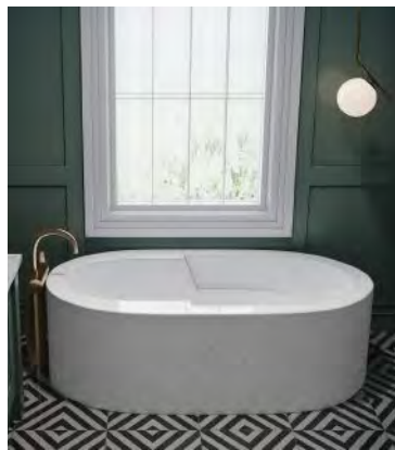
Inspired by the need for a safe and contemporary-style freestanding bathtub, Americh presents Maude, which has a substantial deck that can be used for sitting or safety getting into and out of the fixture. Additional features include armrests and a sloped backrest, as well as optional grab bars and air system. americh.com