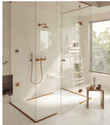
Amerec's AK Generators add a steam shower option to the home shower. The technology allows for consistent flow of steam and temperature maintenance during the steam bath. The stainless steel tank and water level probes provide years of trouble-free operation, notes the company. amerec.com