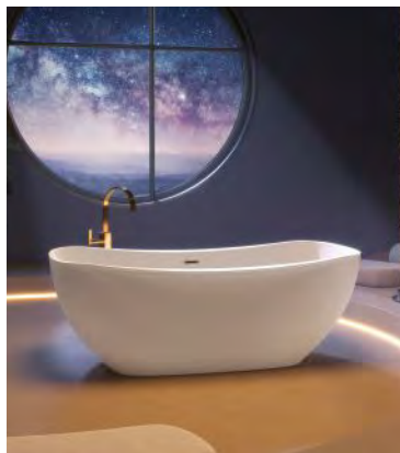
The Libra Stella from BainUltra is the roomiest of the company's Libra collection of tubs, and is outfitted with symmetrical heated backrests for two people. The sleek and opulent design sports curved edges for an elegant look. It is offered with ThermoMasseur, Illuzio chromatherapy and Aromaflow. bainultra.com