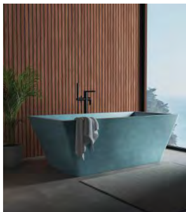
The Mendocino Freestanding Tub from Native Trails sports slanted slides and a deep interior. The tub, made from a sustainable blend of natural jut fiber and cement, features thick walls that provide insulation to maintain water temperature. It is available in five colors, including the new Ocean. nativetrailshome.com