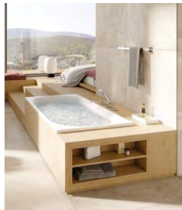
Whirl systems from Schmidlin turn a simple soak into a gentle massage. Tub offerings including Silent, a quiet bubble system; Aqua Silent, a quiet jet system; Hydro Silk, with tiny bubbles; Jet, with jets for an intensive massage; Spa, with air jets for a bubbly wellness experience, and Jet+Spa. schmidlinusa.com

Tubs that can be customized with a range of options to create the exact therapeutic experience the end user craves are also important. “Homeowners want their bathrooms to be a place of relaxation, and bathing is now more of an experience,” offers Storm. “Customizable showers and baths that include extras such as hand showers and body sprays are popular ways to emulate a spa environment.”