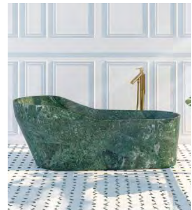
Distinctive veining and nuances, together with attention to thickness and ergonomics, express the Kreoo freestanding bathtub collections. The tubs are carved from a single block of marble, then mixed with wood and metal objects. Shown is Kalypso, customizable in seven different materials. kreoo.com