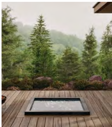
The Soake Cold Plunge from Soake Pools is a 4'x4' cold plunge that can be installed indoors or outdoors. The compact unit is intended for sitting for one or two people, with an interior that is finished with porcelain tile that is customizable in terms of color, finish and tile orientation. soakepools.com