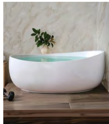
Hydro Systems adds hydro therapies to freestanding bathtubs with two systems: Hydro Fusion enables longer soaks by keeping water heated at a constant temperature, while Hydro Indulge infuses bath water with millions of oxygen-rich bubbles. Cold Plunge and thermal air are also available. hydrosystem.com