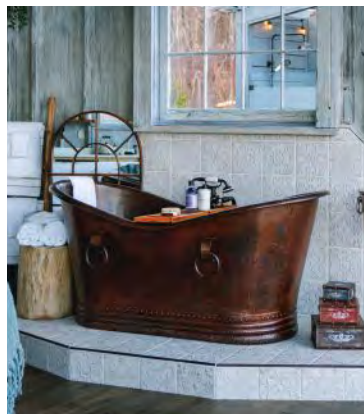
Artisan-made freestanding copper bathtubs from Premier Copper Products are available in a variety of shapes and styles. The tubs are hand hammered of copper, making each a one-of-a-kind piece with distinctive attention to detail. premiercopperproducts.com