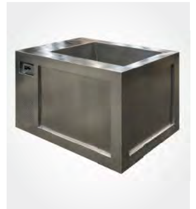
The Fraser stainless steel cold therapy plunge spa/pool from Diamond Spas is kept at 59 degrees or colder and rapidly cools the body. The cold therapy is said to stimulate blood circulation, close pores, detoxify the body, numb the joints, reduce pain and relieve muscle spasms, states the firm. diamondspas.com