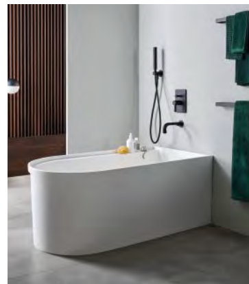
Ceramica Cielo has expanded its freestanding bathtub offering, fashioning the tubs from LivingTec, a soft-touch material. Shown is Febe, a flat-bottomed tub that can be positioned either in the center of the room or against the wall. The small-sized tub has a shelf on one side to hold toiletries. ceramicacielo.us