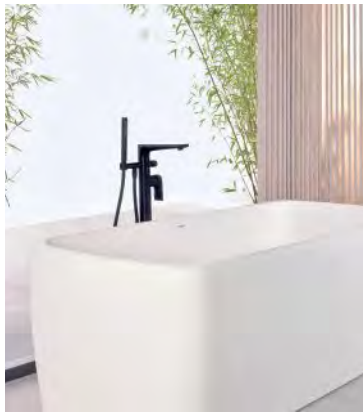
Created in partnership with Studio F.A. Porsche, the Qatego Freestanding Bathtub from Duravit is inspired by stones gently polished by water. The bathtub is made of DuroCast Plus, a strong mineral composite material with a matte, velvety finish, notes the company. duravit.us