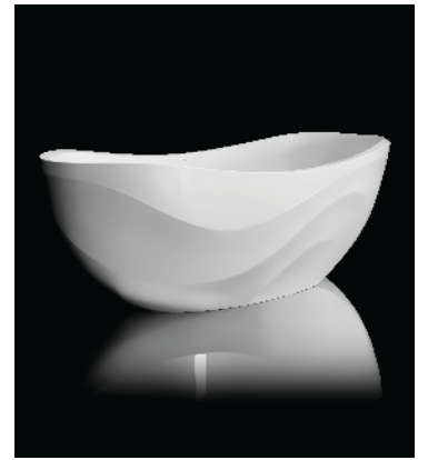
Victoria + Albert's Seros Collection by House of Rohl captures the rippling motion of water in sculpted form, states the company. Its oval silhouette is surrounded by the flowing lines and contours of currents for an organic shape. The freestanding tubs are offered in a variety of sizes in RAL colors. vandabaths.com