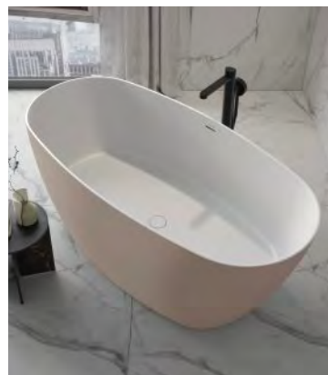
Sculpted from Acquabella's signature Dolotek, an eco-friendly mineral composite that has antibacterial properties, the Carezza freestanding tub offers heat-retention properties that keep water warm longer. It is offered in gloss or matte versions in Snow White or one of four colored exterior options. acquabella.us