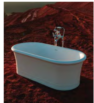
Devon&Devon showcases three retro-style bathtubs created in Florence. The tubs reinterpret the Victorian Age, Romanticism, Art Deco, the Jazz Age and La Dolce Vita with classic-contemporary lines in marble and porcelain as well as sustainable materials such as White Tec Plus. devon-devon.com