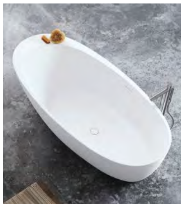
The BMD 01 , an elegant tub that is part of Wetstyle's Mood Collection , is fashioned from the company's WETMAR BiO , an eco-friendly thermos-insulating material composed of soy and mineral stone. Designed by Pierre Belanger and Wetstyle Design Lab , the tub has dual inclined backs. wetstyle.com